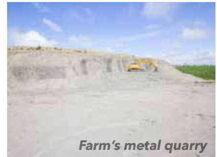
Farm's metal quarry

Dairy 408ha - Support unit 62ha - producing 290,000kgMS from 350ha effective Great location... only 115km to Auckland. Launch your boat within 15mins in the Kaipara Harbour 1265 SH12 and Whakapirau Road, Maungaturoto, Northland