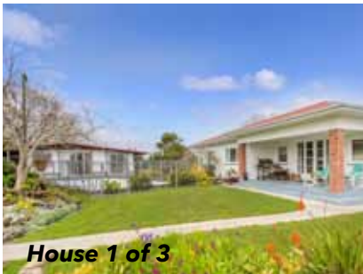
House 1 of 3